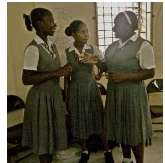
Happy Grove High School students participating in a peace education workshop

The partners also will be working to include Seaside Primary School and a team of Project Sponsors. We are also exploring potential secondary Canadian partners connected to peace education and work with Jamaicans, either in Canada or Jamaica.