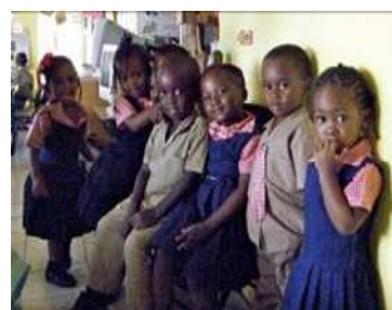
Students of Seaside Basic School

Resource and Material Development and Sharing: This was identified as a key priority, to support Jamaican students and staff, to foster leadership and sustainability for peace education.