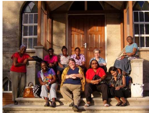
Partners of the Jamaica Peace Education Project in front of the Seaside Friends Church, Happy Grove, Jamaica