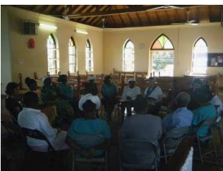
Circle conversation at Seaside Friends Church