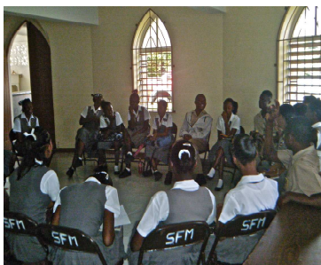
Inaugural meeting of the HGHS Peace Club

The Peace Club: HGHS acted quickly in response to student and staff enthusiasm for starting a Peace Club. The new Club has been meeting since January, 2010, and holding events including a Community Peace March (March 2 nd , 2010)! The Peace Club has requested support for the following: