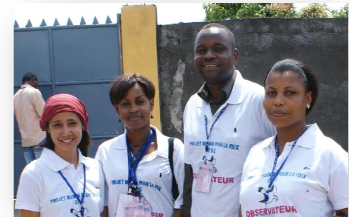
Election monitoring team in the Democratic Republic of Congo

From election monitoring in the DR Congo to helping refugees in Toronto to access settlement services, your donations achieve important results. Read more at: http://bit.ly/UyhIou .