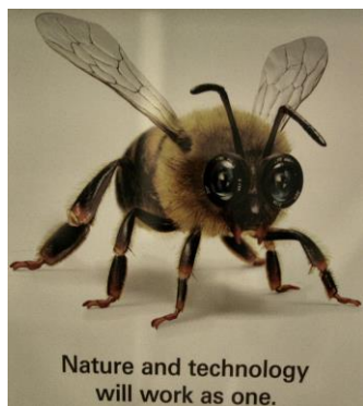
Nature and technology will work as one.

http://quakerservice.ca/news/urgent-action-us-conscientious-objectors-facing-deportation/