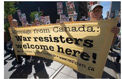
Toronto Friends join in a march in support of COs.

An alarming number of US Iraq War resisters in Canada are threatened with deportation now – and more are expected. Seven C.O.s have received negative decisions on various applications to stay in Canada this fall. While two have already received stays of removal (i.e. deportation) from the court, this may not last past January; other cases are in process, including three who will receive their removal dates in mid-January (with likely one week's notice to leave Canada).