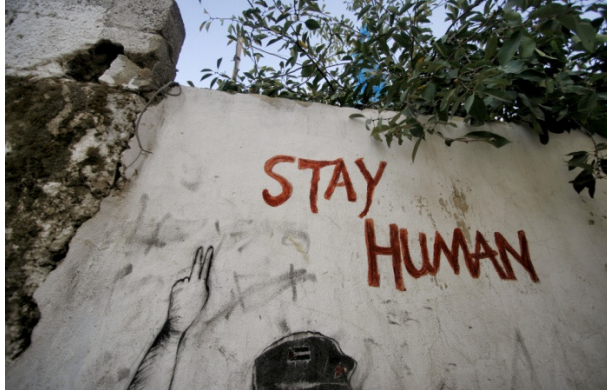
Graffiti in Aida refugee camp, Occupied West Bank.

Canadian Quakers were cited in an article on the front page of CBC News Online on Monday, May 11 th , which reported that Canada may try to criminalize the participation of Friends and others in a nonviolent call for the boycott of products made in illegal Israeli settlements. The Government of Canada called the article "ridiculous" but has not clarified what it meant by telling the United Nations that Canada would adopt a "zero-tolerance" approach to the Boycott, Divestment and Sanctions (BDS) movement, which it labels "the new face of anti-Semitism".