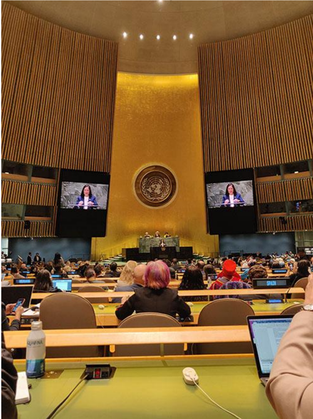
Our view from the United Nations during the Permanent Forum on Indigenous Issues, 2023.

The main goals of CFSC's Indigenous rights work are the implementation of the UN Declaration on the Rights of Indigenous Peoples and greater engagement by Canadians in the Calls to Action of the Truth and Reconciliation Commission of Canada (TRC).