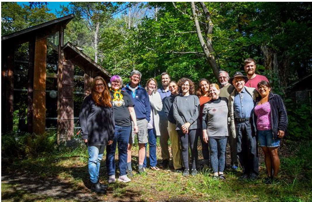
CFSC members and staff during planning meetings at Camp NeeKauNis, September, 2023.

“For Friends the wellspring of faith is the search for what George Fox and early Friends described as the Inner Light... the Truth.”— Faith and Practice , Canadian Yearly Meeting