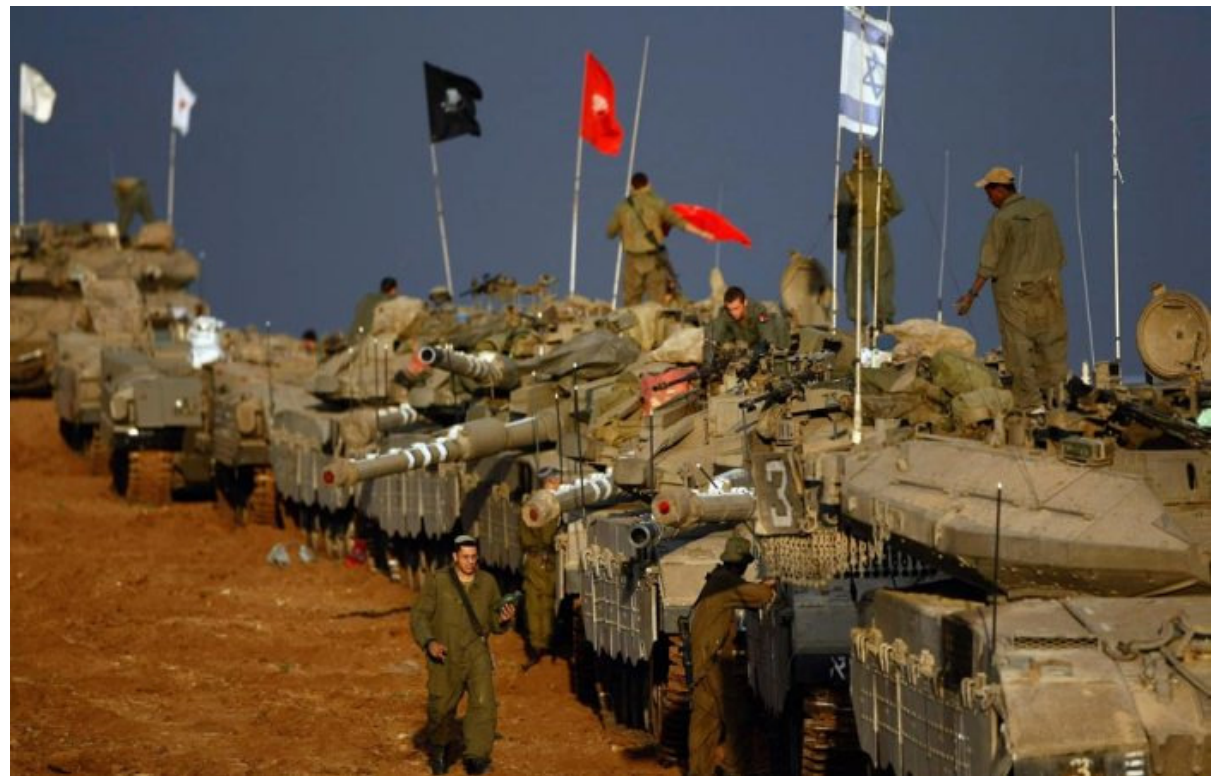
Scene near the Israel-Gaza border December 29, 2008 – credit Amir Farshad Ebrahimi CC-BY.

Matt was also interviewed for The Citizen's Forum , a program broadcast on cable TV in Victoria, BC: <u>https://www.youtube.com/watch?v=Ud_jk551Bm0</u>