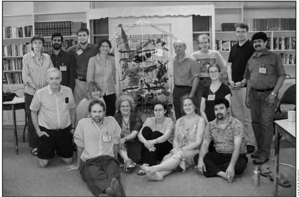
Members of the Quaker International Affairs Program Committee and Canadian and international participants in last summer’s exploratory seminar on the commons gather around the weaving that we created over the weekend as a visual expression of our exploration of the meaning and importance of commons to communities globally.

Figuring out what the commons is was challenging, as there are a range of understandings, definitions and terms. Terms such as ‘a common pool resource’, ‘a public good’, ‘a customary system’, ‘a publicly owned asset’, ‘a commons’ and ‘a private good’ are not always clearly understood or agreed upon and may be used interchangeably and inconsistently. For QIAP, a general sense emerged that the term ‘commons’ was used to define “a