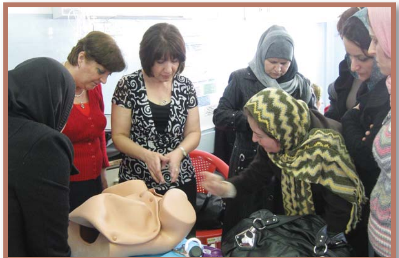
Students receiving training on safe labour techniques in Iraqi Kurdistan.