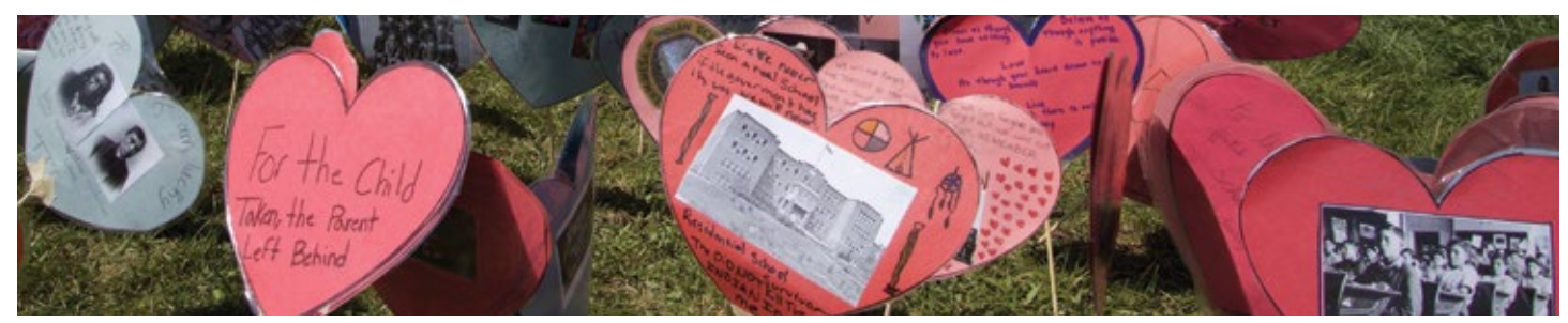
Heart Garden planted by students of Ermineskin Junior Senior High School on May 14, 2015.