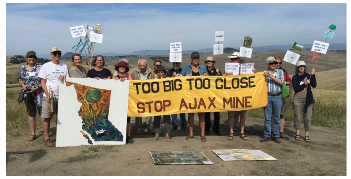
KAIROS volunteers near Kamloops BC during one stop on the Rolling Justice Bus tour in support of communities affected by mining."