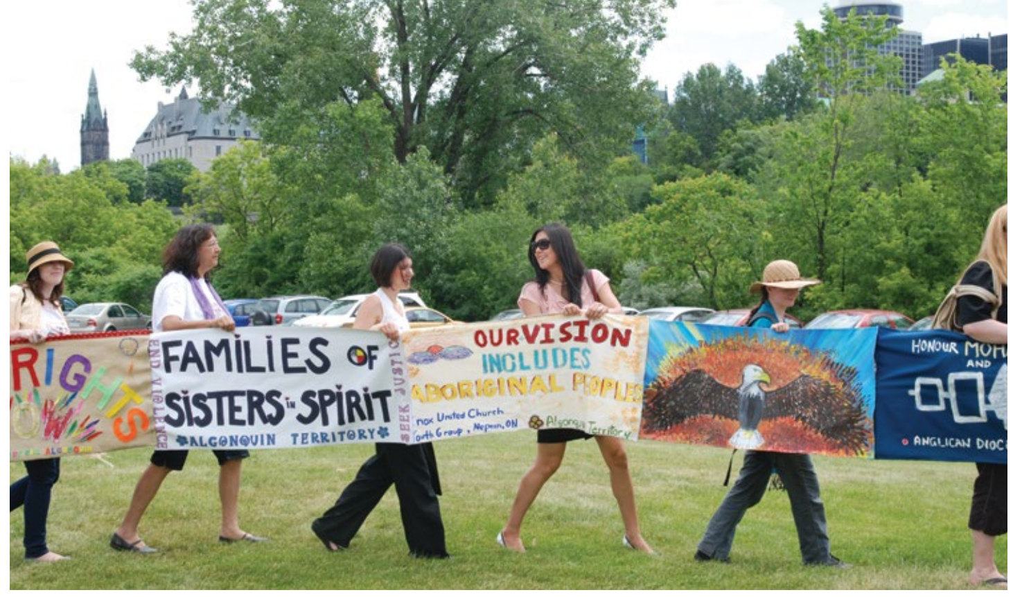
Roll with the Declaration event in Ottawa in 2011.

Yes. The legacy of colonialism is deep and painful. Reconciliation is hard work: emotionally, mentally, physically, socially and spiritually. Non-Indigenous Canadians are encouraged to learn the common history shared with Indigenous Peoples and spend time building relationships with Indigenous Peoples. As people of faith, we will have our assumptions challenged and be forced to face our fears. It takes courage to offer your voice and your action to the work of reconciliation, justice and peace-making. At the same time, the gifts of forgiveness, healing, and hope are rooted in God's promise to be with us and to guide us. The work of implementing the UN Declaration will also be joyful and uplifting – knowing that the rights of all are being respected.