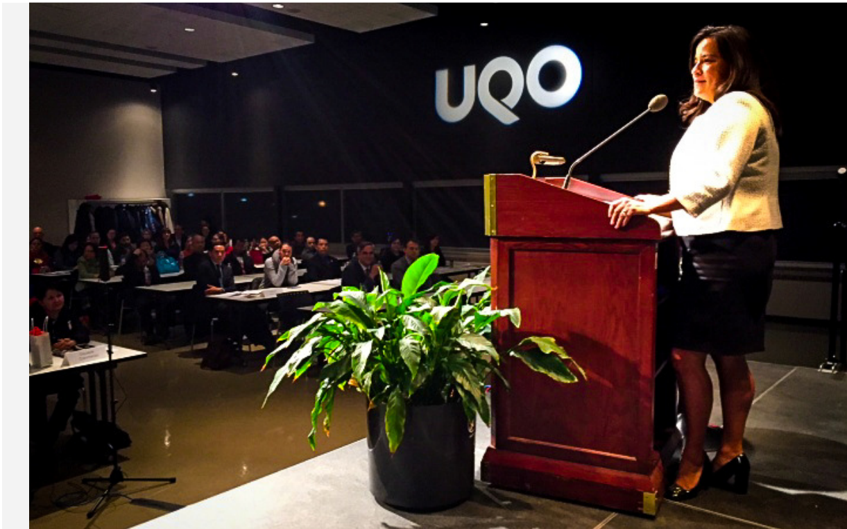
At a symposium CFSC helped organize, Justice Minister Jody Wilson-Raybould makes her surprise announcement

The Truth and Reconciliation Commission of Canada (TRC) has called the UN Declaration on the Rights of Indigenous Peoples the “framework for reconciliation.” Its implementation is the main goal of CFSC’s Indigenous rights work.