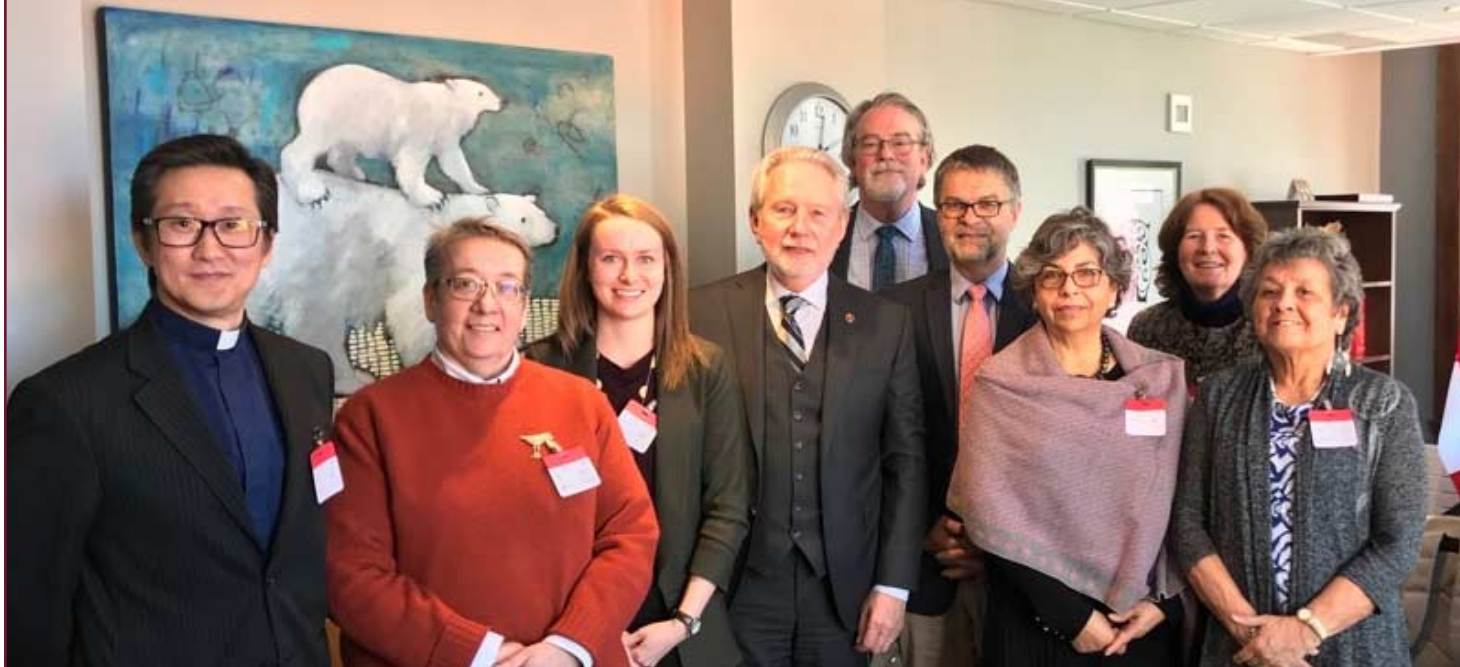
Church delegation meets with Senator Harder, March, 2019