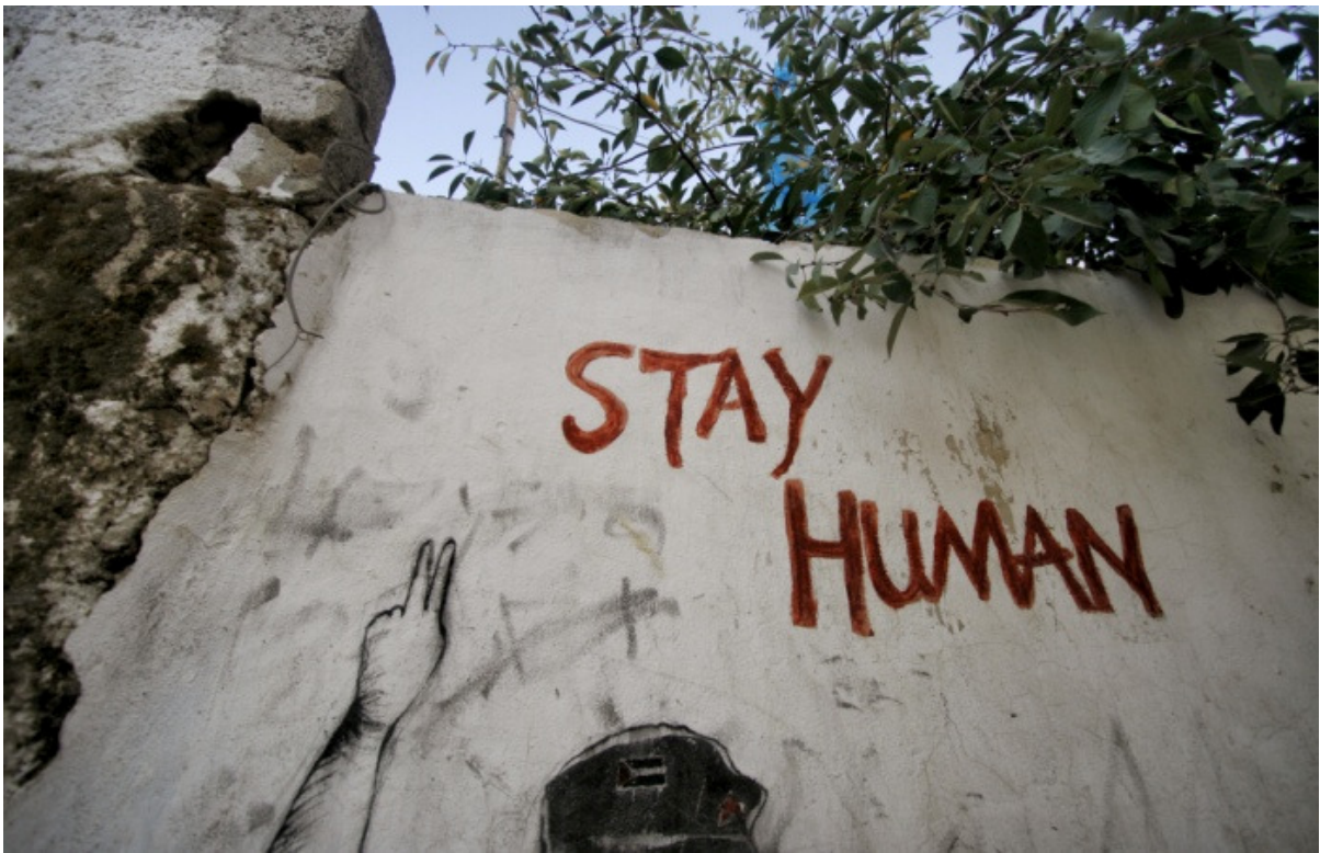
Graffiti in Aida refugee camp, Bethlehem, Occupied Palestinian Territory.