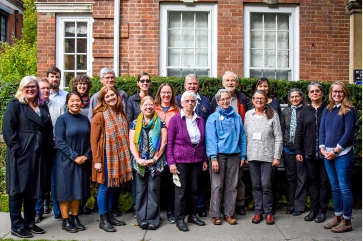
CFSC members and staff in front of Toronto Friends House, 2019

governments to address antisemitism by rejecting this new definition and instead seeing antisemitism as a form of hate that can best be addressed together with other forms of racism and hate. CFSC endorses the petition and encourages anyone so led to consider signing and sharing it: https://actionnetwork.org/petitions/fighting-antisemitism-is-essential-but-the-ihra-definition-is-the-wrong-approach