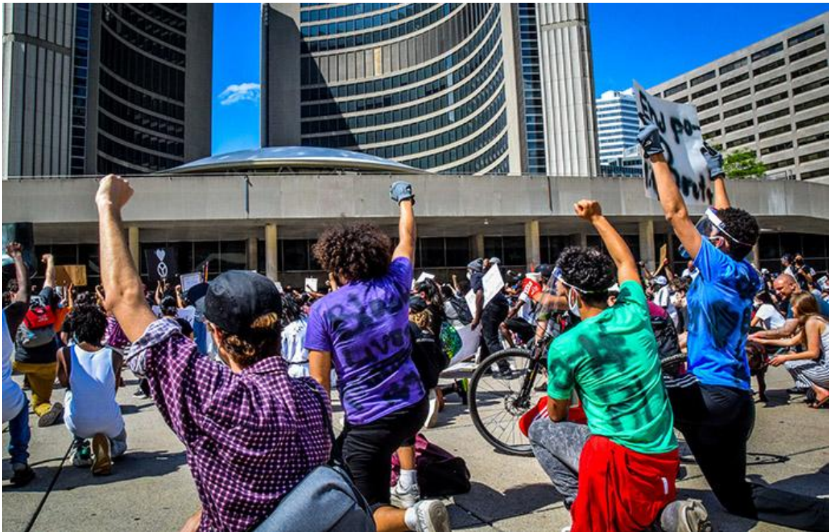
Community members take a knee in front of City Hall in Toronto, June, 2020.