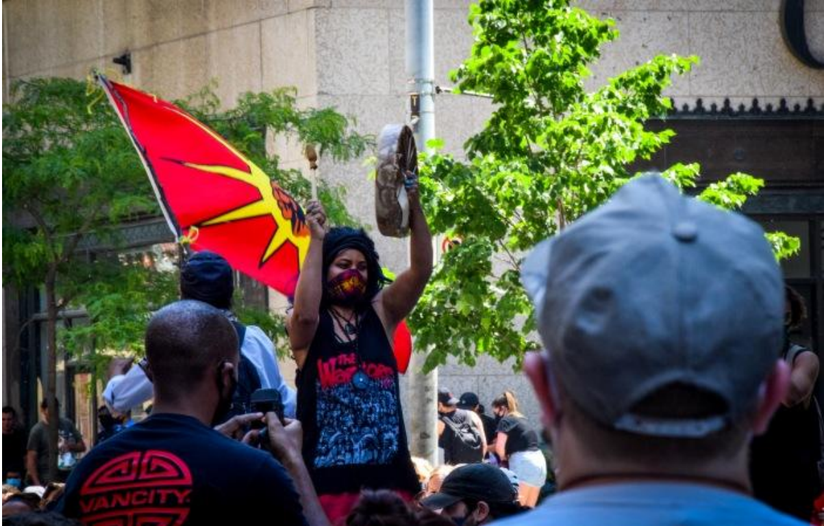
Rally calling for defunding of police and other major changes in response to police violence, June 2020