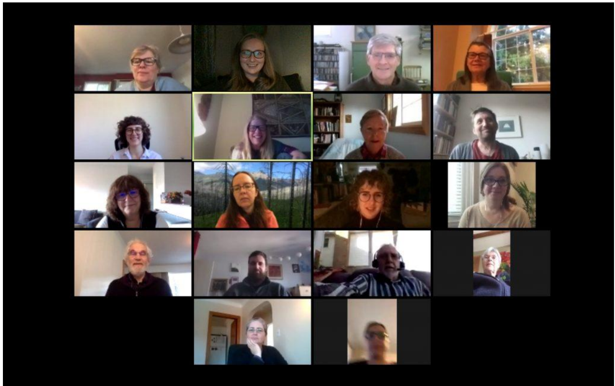
CFSC members and staff meeting via Zoom, October, 2020.

“True faith is not assurance, but the readiness to go forward experimentally, without assurance. It is a sensitivity to things not yet known.”—Charles Carter