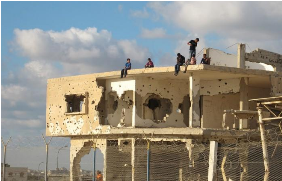
Gaza, 2011, credit UN Photo/Shareef Sarhan CC-BY.

You can find out more information and see a template for writing to your Member of Parliament at https://NoFighterJets.ca