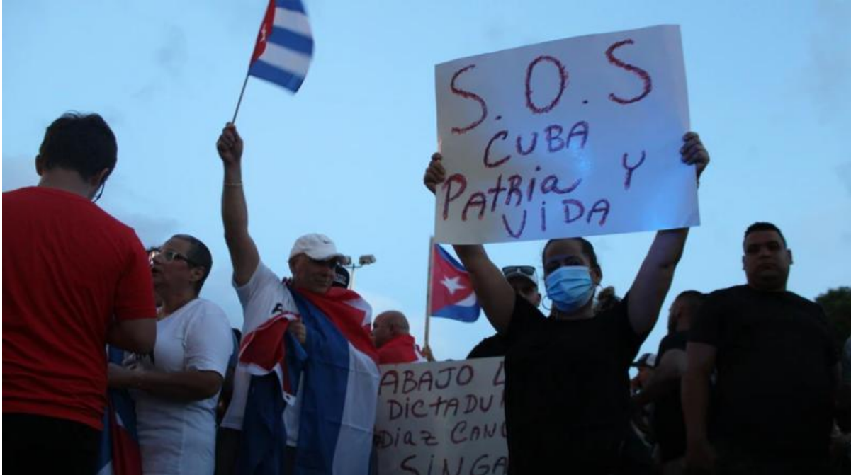
Protesters in Miami, Florida call for "help for Cuba," July, 2021.