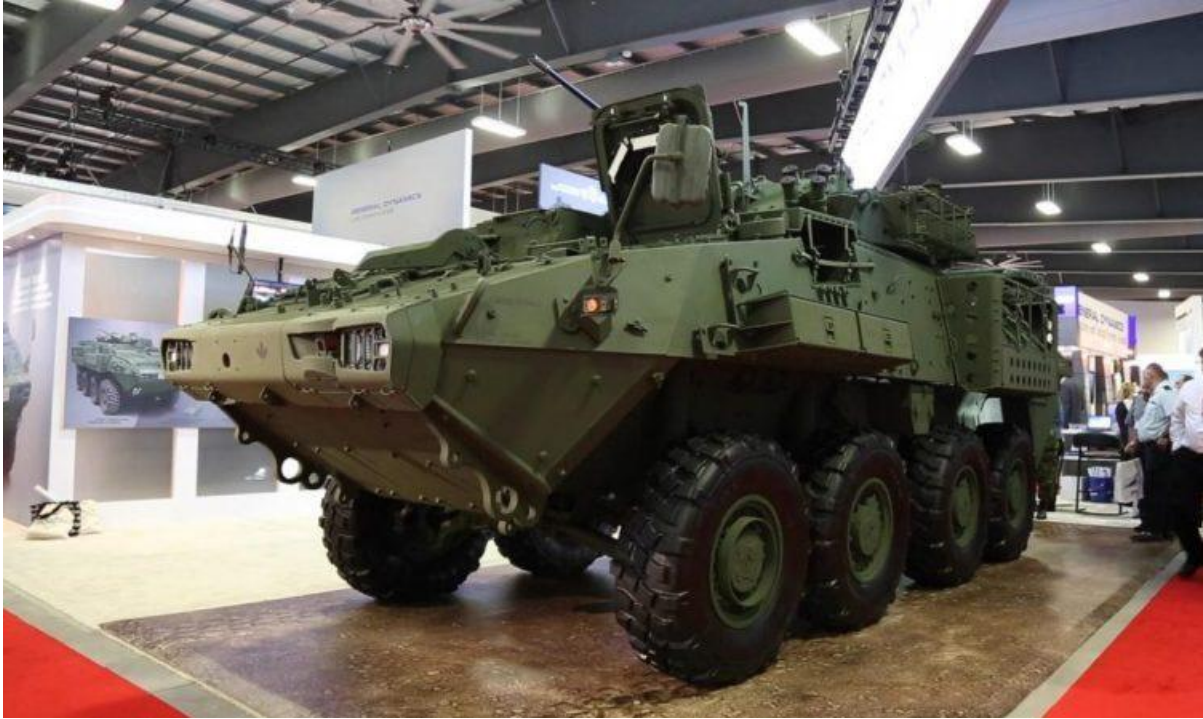
Canadian light armoured vehicle.