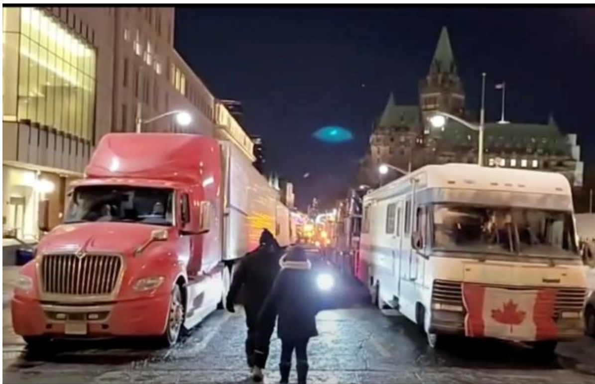
"Freedom Convoy", Wellington Street, Ottawa, Jan. 28, 2022.

"The way that Canada can be useful at this moment is to stand up to hawkish forces within our own country and amongst our allies, to stand up to weapons lobbyists and those who would profit from a horrible war, and to work relentlessly for peace," notes a new open letter from Canadian Friends Service Committee. Read our suggestions to the government of Canada: https://QuakerService.ca/Ukraine