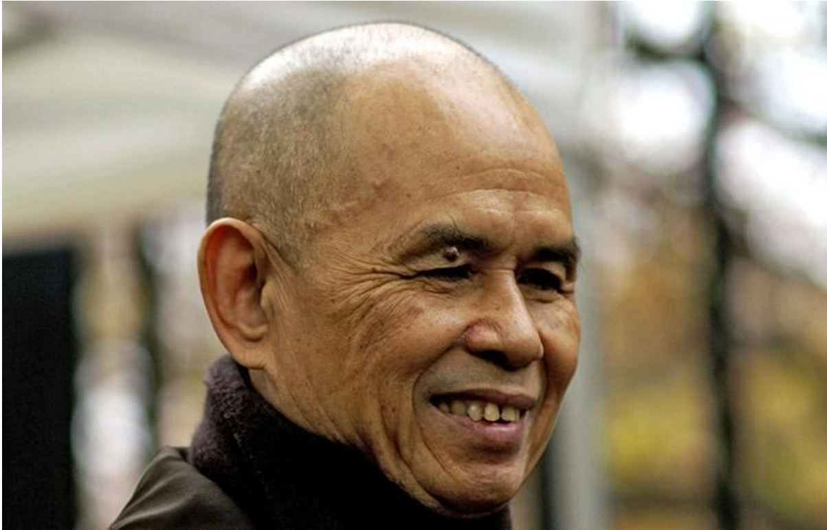
Thich Nhat Hanh.