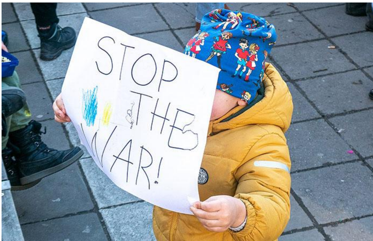
Demonstration in Stockholm, Sweden, against the Russian invasion of Ukraine, Feb 27, 2022.

To learn more about the Sustainable Development Goals as they relate to Indigenous peoples you can watch an expert symposium taking place April 6-7 online. Find out more and register at: https://DeclarationCoalition.com .