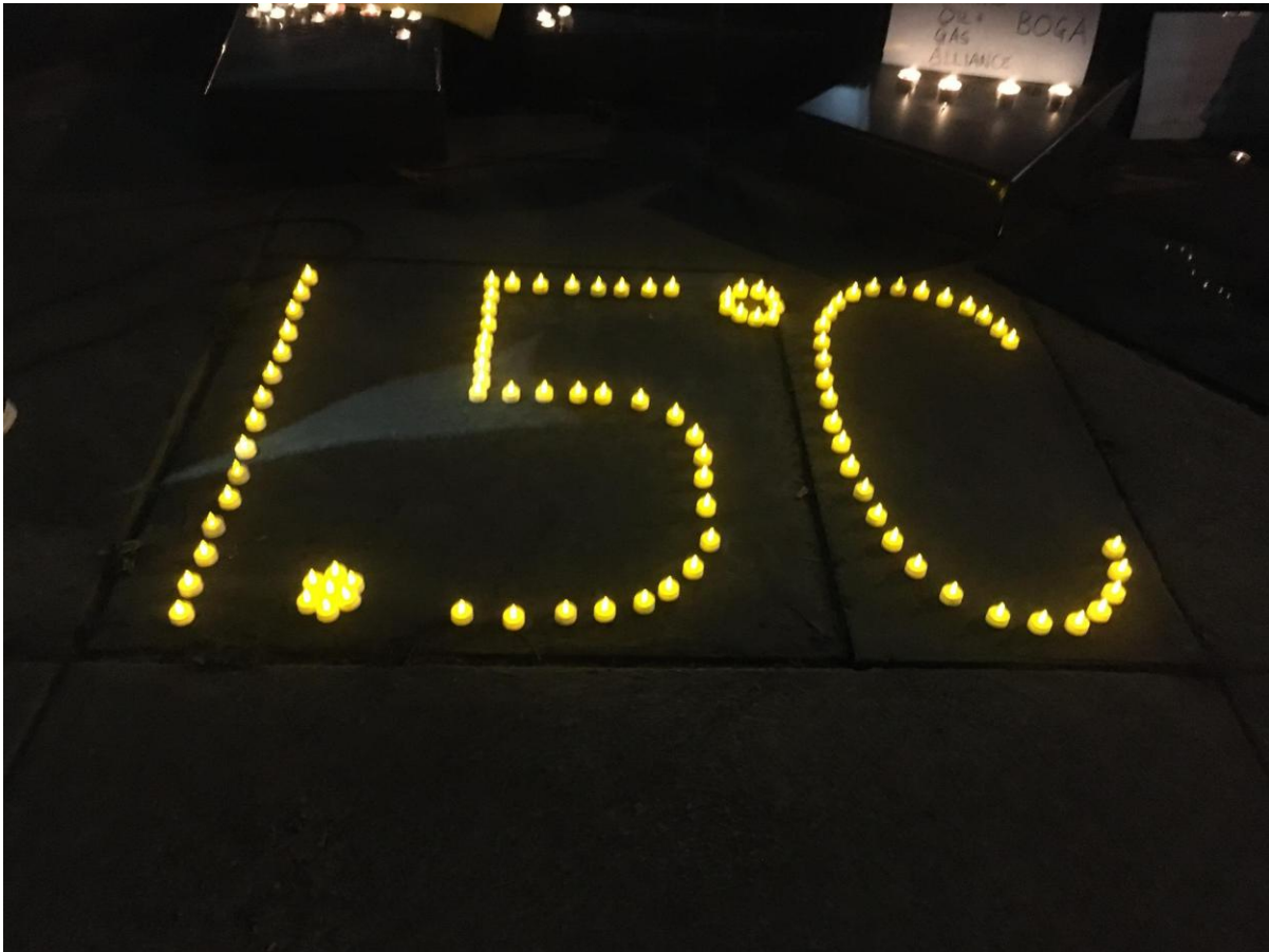
Battery powered tea light spell out 1.5 C at candlelight vigil in Toronto, 2021.

Pick a short video that interests you and have a look!