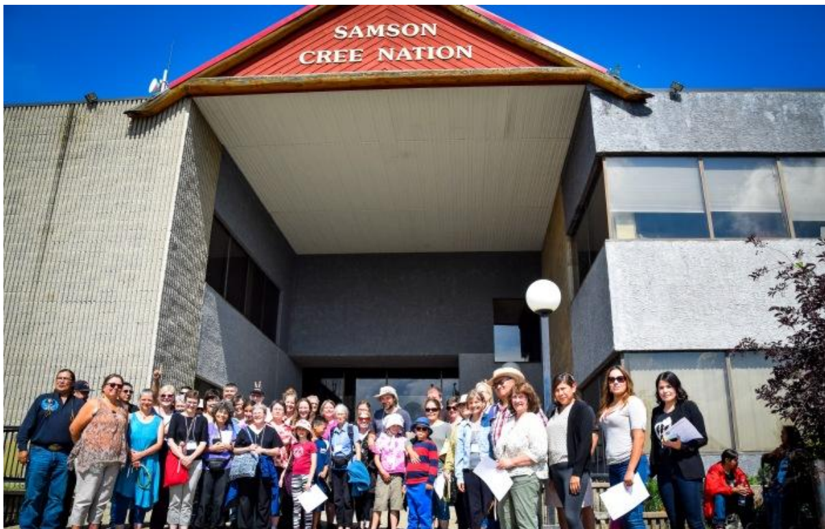
Canadian Friends visit Samson Cree Nation and later commit to take action with deep reconciliation and decolonization efforts, 2016.

Please consider writing your own letter and signing and sharing this petition .