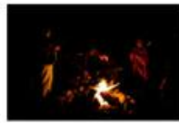
CFSC staff and volunteers gathered around the camp fire after a full day of community meeting.

In thinking about my words, I see that they were about more than just the fire that needed tending quickly as it wouldn't go out.