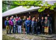
Members of the CFSC staff and volunteers gathered for a community meeting in the early 2020s.

"What, if not all, people across the transnational community of peace? Considerately working with..."