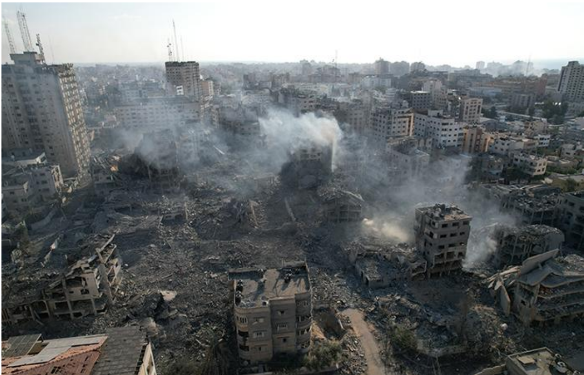
An image of the devastation in the Gaza Strip, October, 2023.