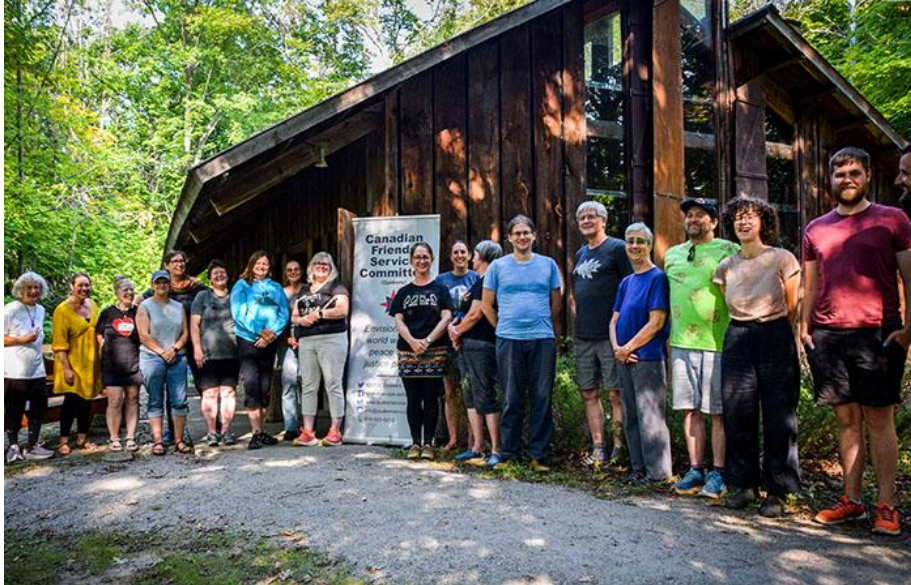
Lead image from CFSC's 2024 Annual Accountability Report.