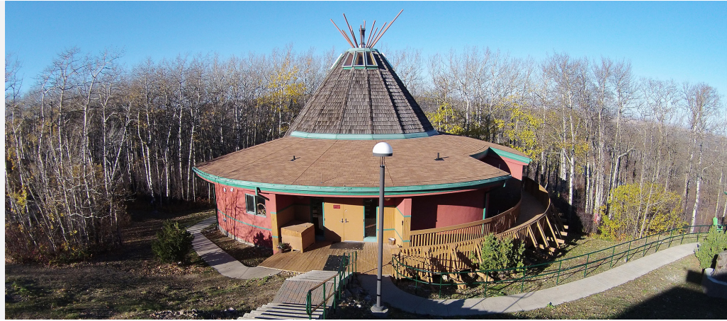
Okimaw Ohci Healing Lodge for women.

Not only are Indigenous people massively over-represented in the Canadian carceral system, they're also more likely to be kept in maximum security. People are classified as candidates for maximum security depending on three factors: