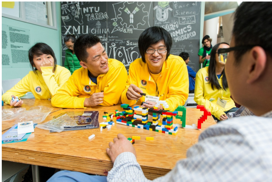
A synthetic biology team at the international Genetically Engineered Machines competition.