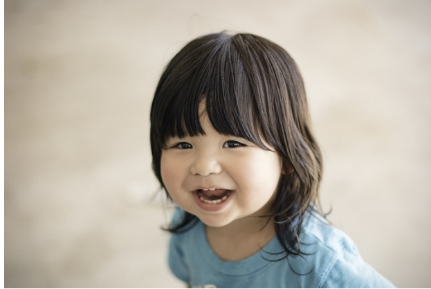
Are we ready for the implications of using synthetic biology techniques in humans?